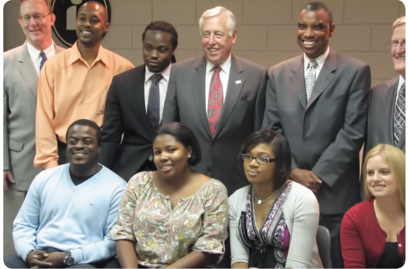
Congressman Steny Hoyer wanted to hear thoughts of First Generation College Bound alumni on Pell Grants

U.S. Rep. Steny Hoyer of Maryland visited with First Generation College Bound staff, board members and alumni in September 2011 to hear their thoughts on the importance of the federal Pell Grant program. Pell Grants are financial awards of up to $5,550 a year to help low and moderate-income students pay for college.